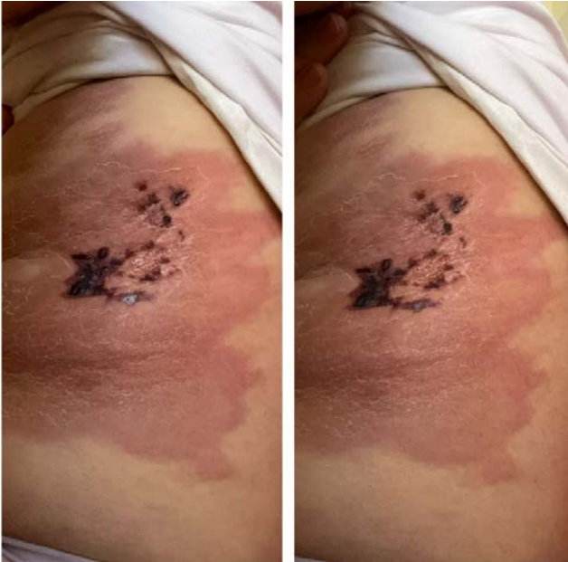
Figure 3. The progression of Carcinoma erysipeloides following an initial diagnostic error. The image captures the exacerbated condition of the skin tumor, displaying extensive erythematous lesions with raised borders that indicate a severe advancement of the disease due to delayed recognition and appropriate treatment of this cancer type.