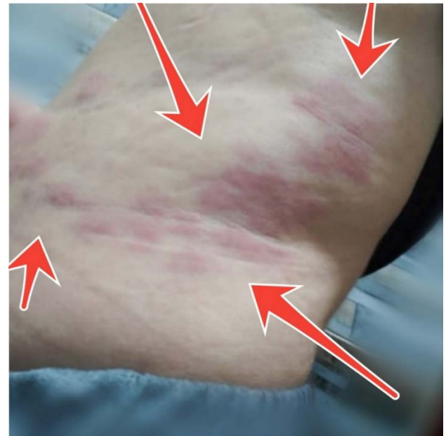
Figure 1. The initial presentation of Carcinoma erysipeloides, characterized by subtle skin changes that were initially mismanaged due to the rarity of this condition. The image illustrates the early stage of this skin cancer type, where the lesions appear deceptively benign, leading to an underestimation of the severity and necessary medical intervention.

both cold ischemia and fixation times met the ASCO/CAP guidelines requirements.