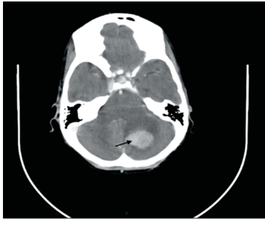
Figure 4. Nineteenth months after C-section, Computed tomography imaging of cerebellar metastasis (see arrow).

Nineteenth months after C-section, progression of the disease was observed and a cerebellar metastasis was found (Fig. 4). She underwent surgery. Liver function tests worsened one month later and an abdominal ultrasound showed bigger liver metastases (Fig. 5). She was then admitted with tension ascites (Fig. 6). Unfortunately, two months later (1 year and 10 months after GBC diagnosis), her clinical condition deteriorated and the patient died.