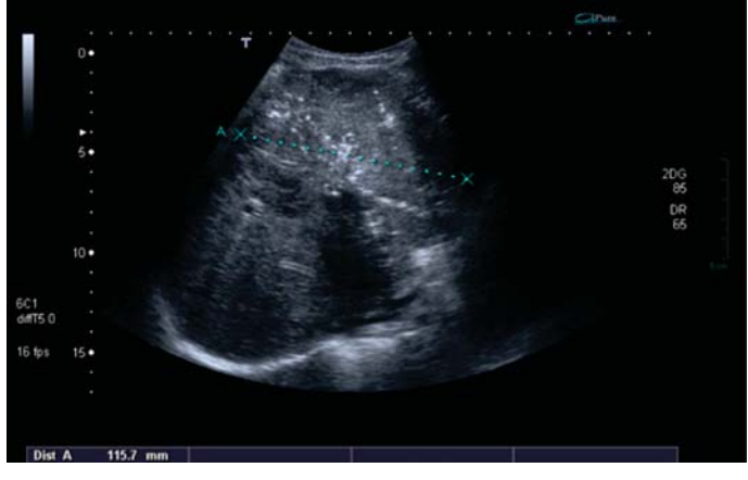
Figure 5. Abdominal ultrasound showing larger liver metastasis.