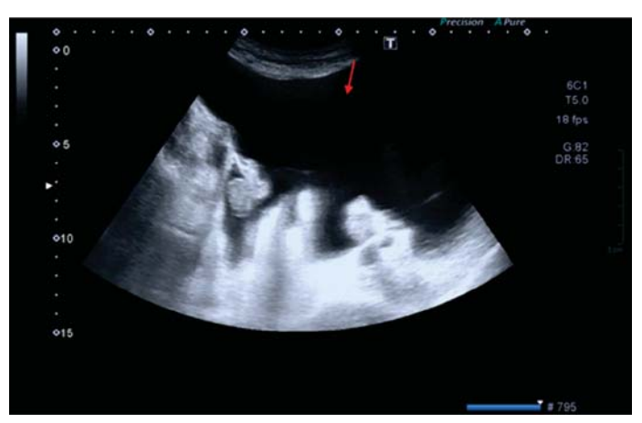
Figure 6. Ascites detected by abdominal ultrasound.