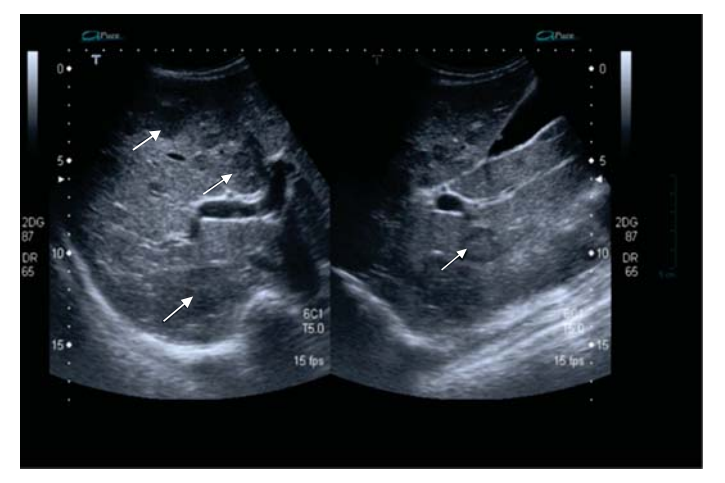
Figure 3. Abdominal ultrasound with an enlarged liver filled of metastasis (see arrows).