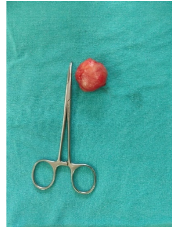
Figure 3. Photo of one of the excised fibroadenoma

Genetic consultation is currently not available in the institute, so we could not offer it to any of the patients.