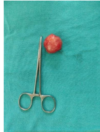
Figure 3. Photo of one of the excised fibroadenoma

Genetic consultation is currently not available in the institute, so we could not offer it to any of the patients.