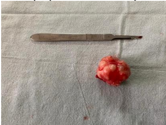
Figure 2. Photo of excised fibroadenoma

A 17-year-old female presented with lump in right breast for 6 months. She had a history of open appendectomy 4 years back with no complications.