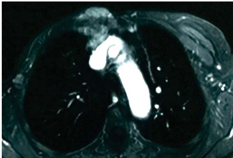
Figure 1. Axial thoracic MRI with fat suppression and contrast injection. There is a lobulated well defined heterogeneous enhancing mass on the anterior right side of the chest wall with right side sternal body involvement and right costochondral junction invasion. The mentioned mass extends to the anterior mediastinum and has a close contact with both brachiocephalic veins without apparent signs of major mediastinal vessels extension. A prominent lymph node is also visible in the right axilla.

defined heterogeneous enhancing mass on the anterior right side of the chest wall which involved the sternal body and the right side costochondral junction. The mass was in close proximity to both brachiocephalic veins but did not invade the vessels (Figures 1 and 2). Fine needle aspiration of the sternal mass and the smaller mass in the lateral part of the mastectomy incision revealed malignant cells. Core needle biopsy was not performed due to the use of Dabigatran.