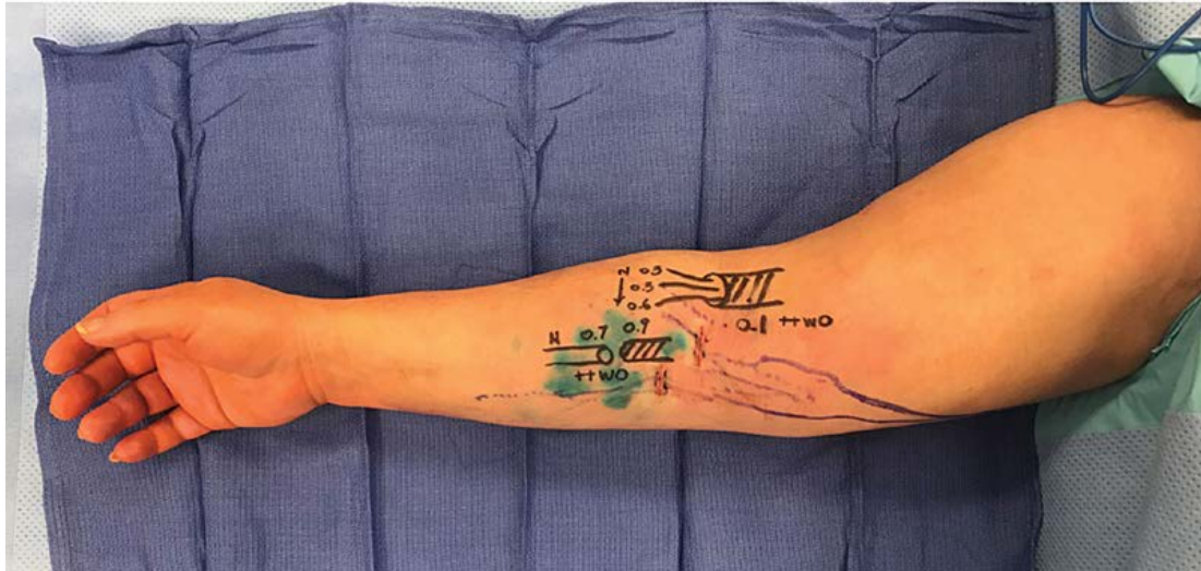
Figure 1. Following lymphatic mapping (green) with ICG lymphography and venous mapping (blue) with an infrared vein finder, 2-3 cm incisions (red) are marked near the elbow in proximity to these two structures. Dissected lymphatics are graded as normal, ectatic (mild injury), contracted (moderate injury), or sclerotic (severe injury) – in subclinical lymphedema, a sufficient quantity of healthy/normal lymphatics should be available for use. Because lymphatic vessels are sufficiently healthy, only one to two incisions are needed to create an adequate number of anastomoses. Following anastomosis, patency is confirmed with positive “washout” signs (absence of blood in the venous lumen); because lymph vessel contractile function is preserved in subclinical lymphedema, this sign is quickly and easily observed. The final anastomoses created in this patient are depicted in the diagram on the arm. Measurements of each vessel (in mm) are marked (erratum: the proximal-most vein, marked 0.1, measured 1.0mm). ICG: indocyanine green, N: normal, ++WO: briskly positive washout sign, Tubes without fill and lines: the utilized lymphatics, Tubes with dashed line fill: the utilized veins.

quickly and easily observed. The low number of incisions and high-quality vessels allow a relatively technically straightforward procedure; thus, operative time is generally less than 1 hour. The procedure is performed on an outpatient basis. For most patients, no narcotic pain medication is needed.